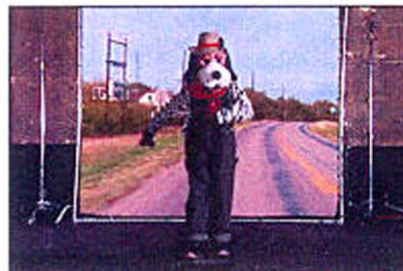
On The Road Again