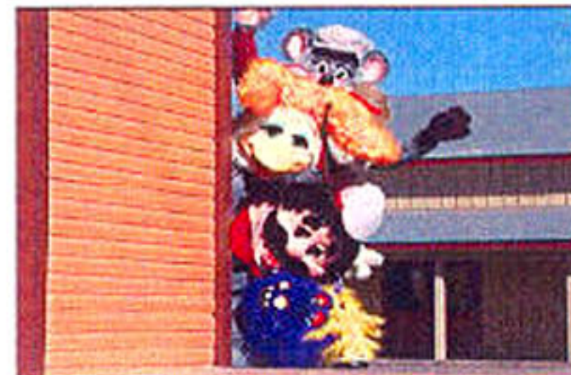
Huh, That's a deal!