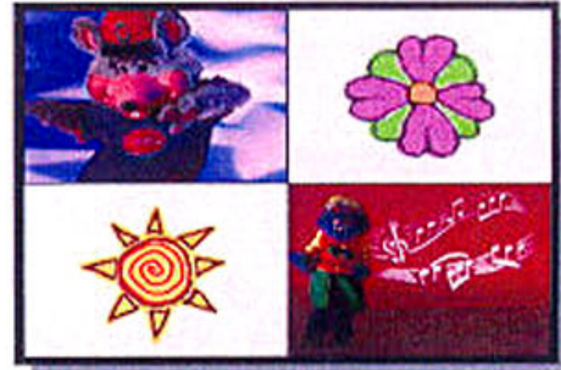
Walking On Sunshine