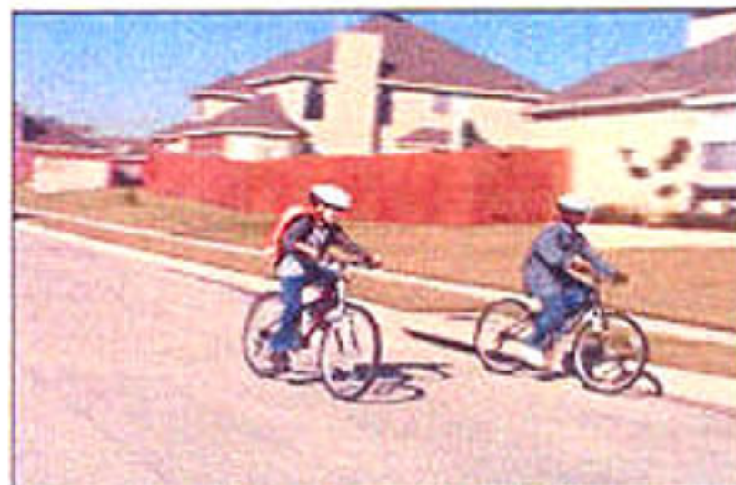
Let Me Be There

Got show ideas? Email us at cectv@ cecentertainment.com