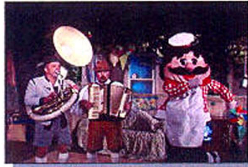
It's time for the Polka Minute!