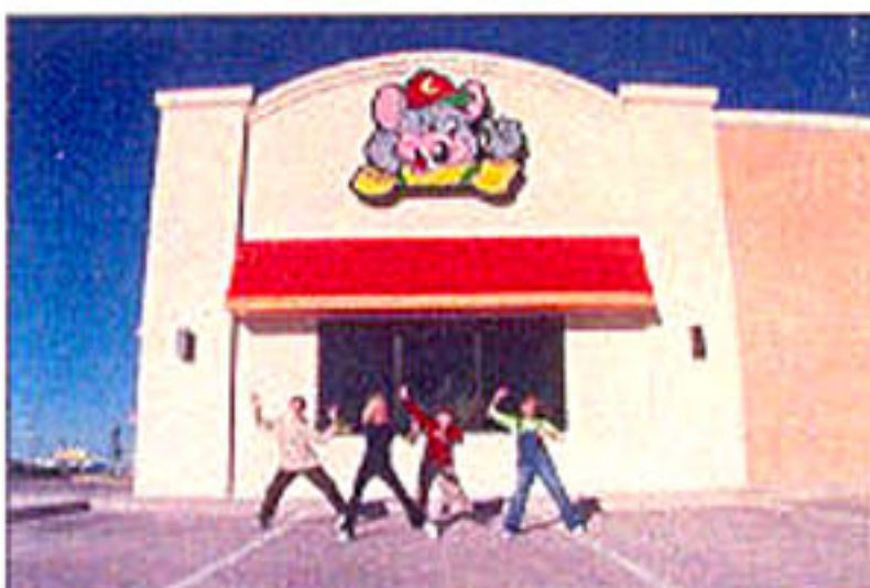
Bring The House Down