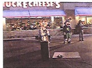
Good times are rockin!