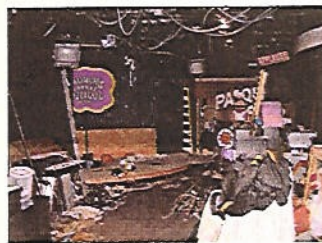
What A Mess!