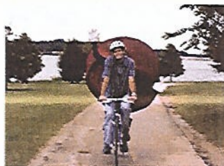
Everyman's best friend, a giant Pepperoni.