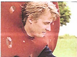
P P P Pepperoni!