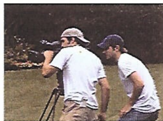
Spike Jonze & Michel Gondry wannabe's