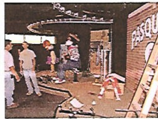
This will work, right?