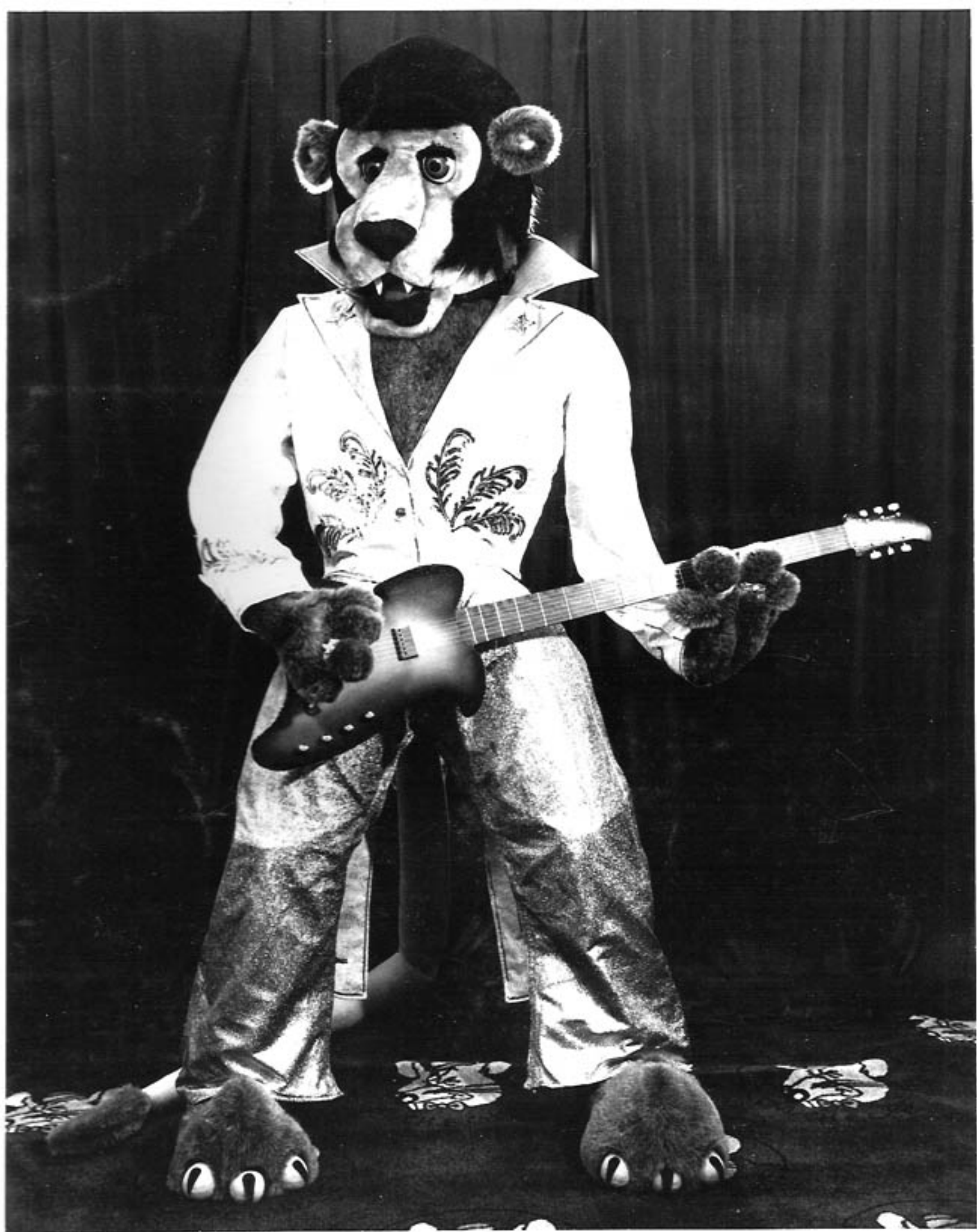
DRAWING RAVE REVIEWS IS "THE KING," PIZZA TIME THEATRE'S ROCK 'N' ROLL LION WHO SINGS ELVIS PRESLEY TUNES NIGHTLY IN THE LOUNGE ROOM.