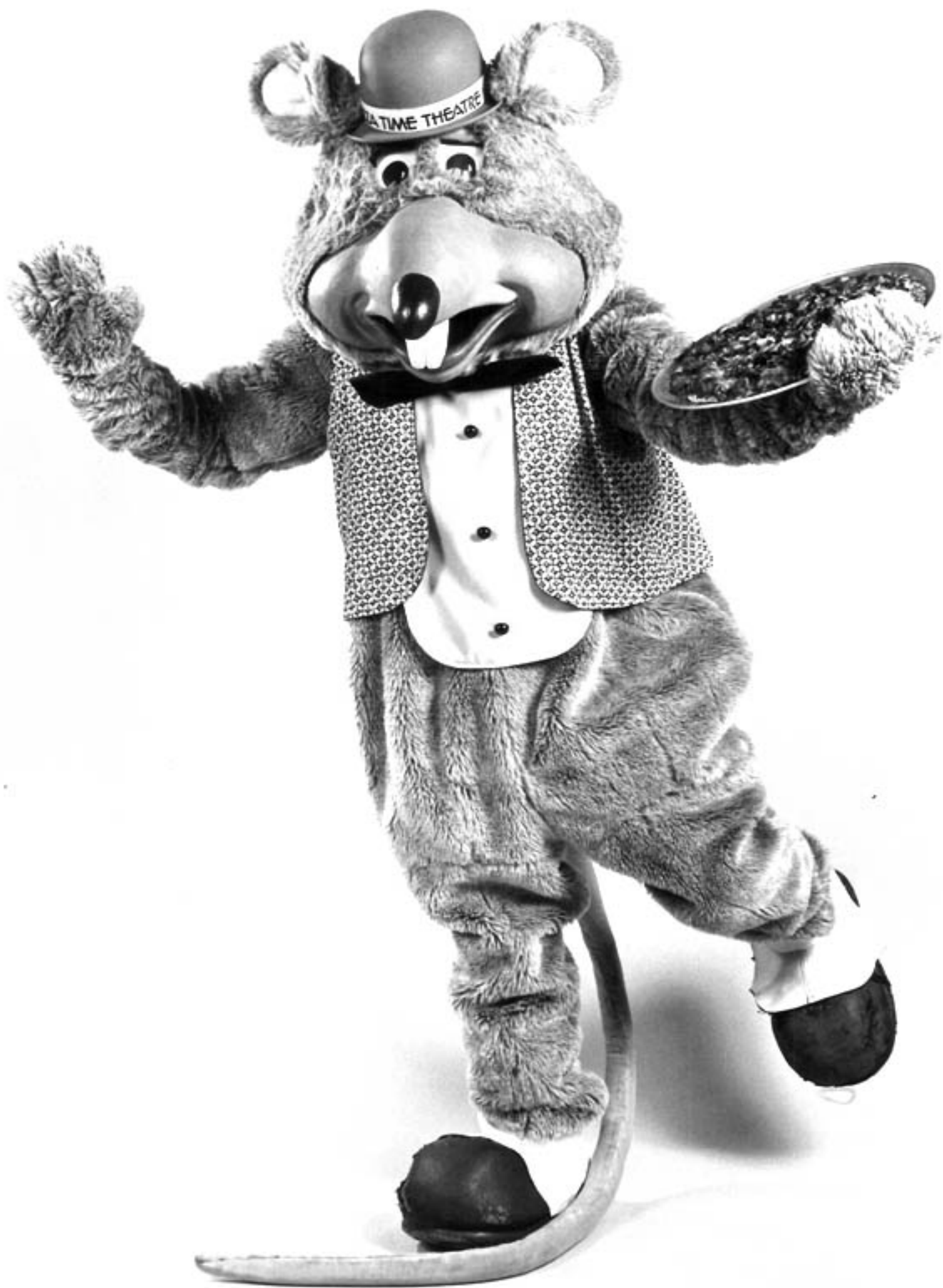
STREET-WISE, NEW JERSEY-BORN CHUCK E. CHEESE HEADS UP THE PIZZA TIME PLAYERS. HE'S AFFECTIONATELY CALLED "THE BIG C."