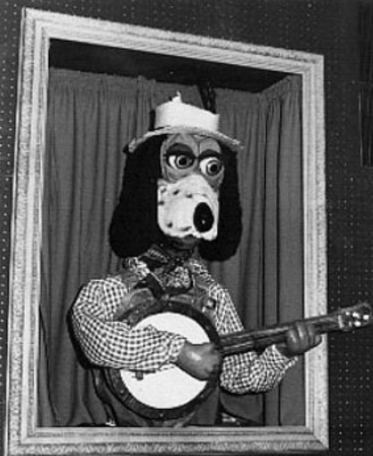
JASPER T. JOWLS