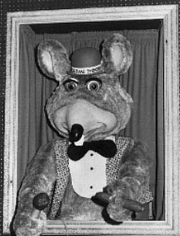
CHUCK E. CHEESE