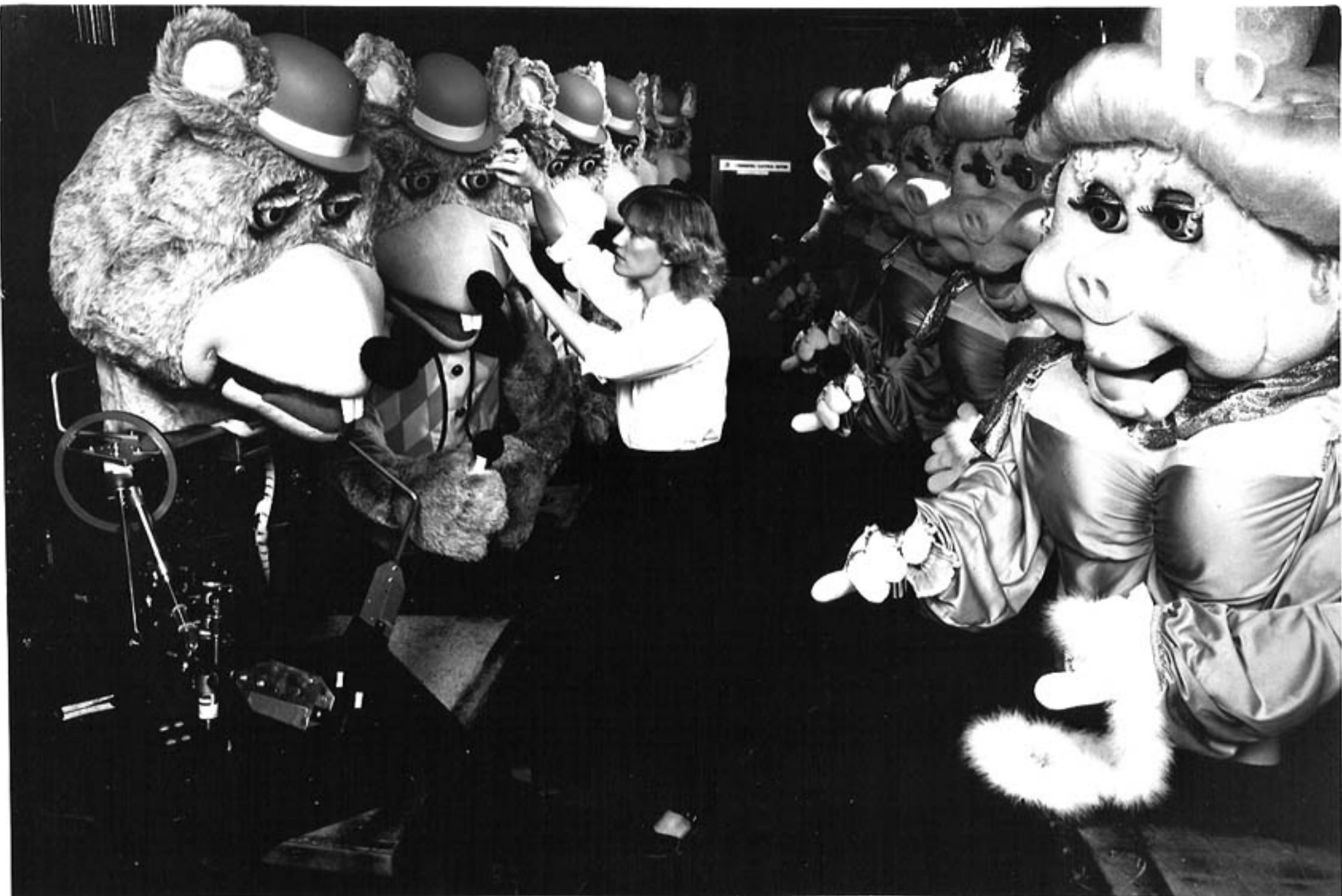
Pizza Time Theatre's animated characters, called "Cyberamics," assembled in the company's new 60,000 square foot manufacturing in Milpitas, Calif. Chuck E. Cheese, on the left, and Madame right, entertain in nearly 250 Pizza Time Theatres across the as well as in Canada, Australia and Hong Kong.