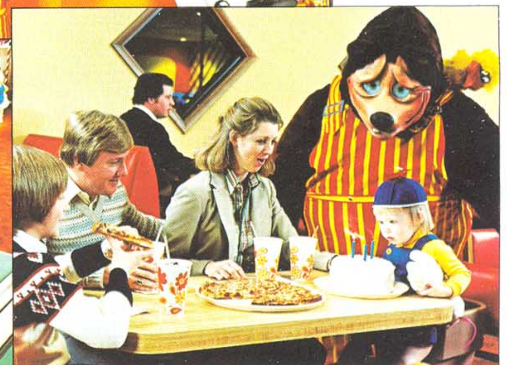
GREAT FOR BIRTHDAYS