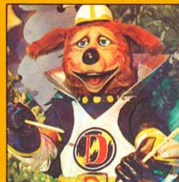
DUKE LARUE A Dog-Gone Good Drummer