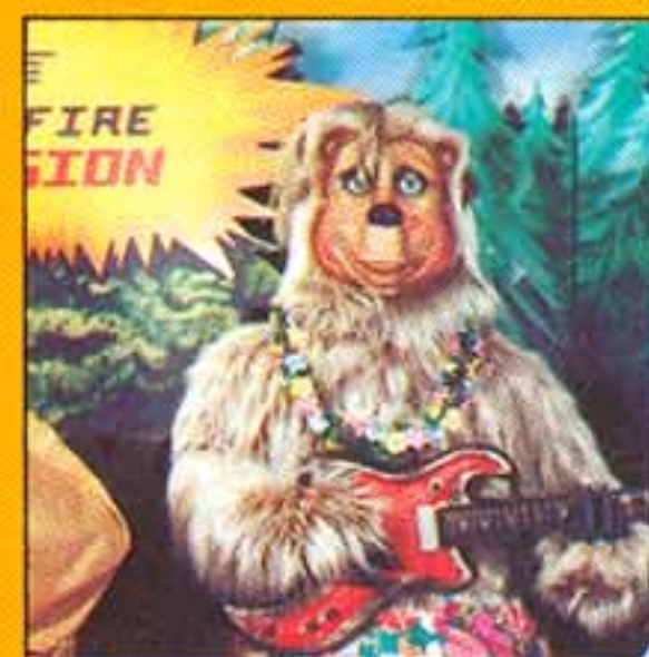
BEACH BEAR That Rustic Rascal of Rock 'n Roll

"The Rock-Afire Explosion!" They sing. They joke. They're almost human.