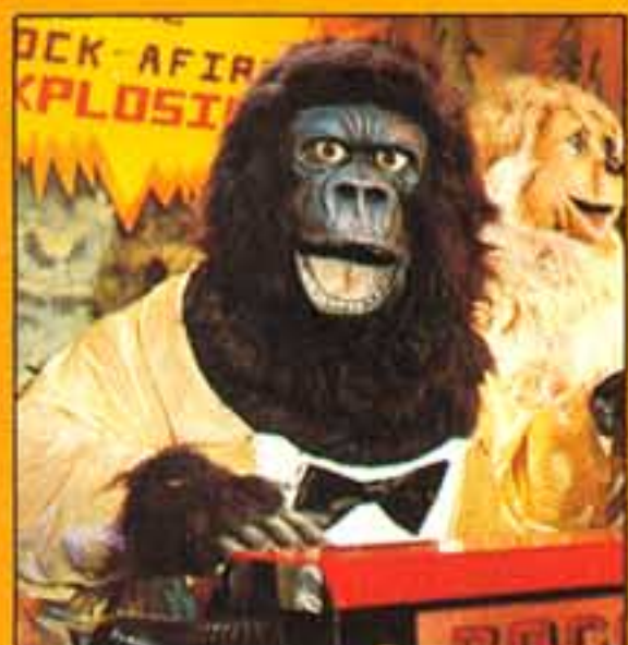
FATS The King Kong of the Keyboard