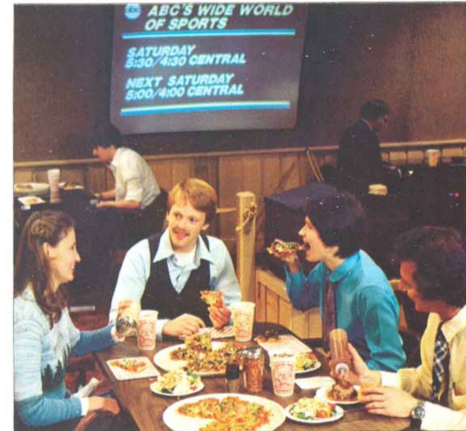
THE SPORTS ROOM

The company's first pilot store in Kansas City, Missouri, opened to overwhelmingly favorable response. Since then two more stores have opened in Kansas City, plus new locations in Florida, Oklahoma, Iowa, Kansas, Colorado, Illinois and Louisiana. Additional ShowBiz Pizza Places are opening at the rate of three to four per month throughout the Midwest and Southeast.