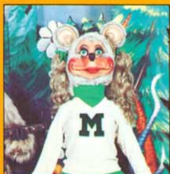
MITZI MOZZARELLA The Sweetheart of Pizza Pie