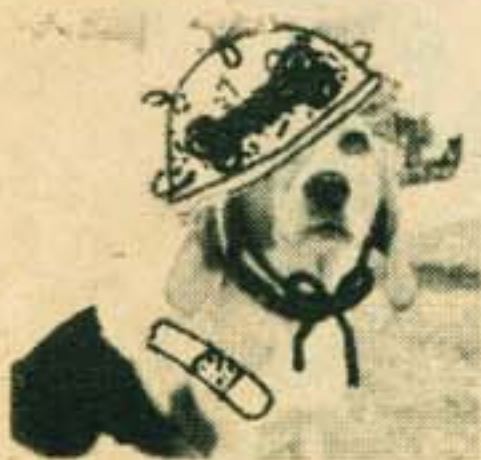
THE FIRST COLANDER-HEAD TO BE HIT BY A CAR

The cartel, which was formed in 1974 has been very successful in monitoring the supply of colanders to a waiting world. While the value of other commodities, including precious metals and gems, has fallen in recent months, colanders continue to increase in value proving that in today's tough times it takes a little craziness to keep from going insane.