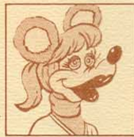
"THE SWEETHEART OF PIZZA PIE"

In an exclusive interview with Mitzi Mozzarella, the girl vocalist with ShowBiz Pizza Place's Rock-Afire Explosion, Ms. Mozzarella revealed a secret desire to appear in your city ever since her vaudeville days when she toured this area with "The Cheesettes", an all-girl band.