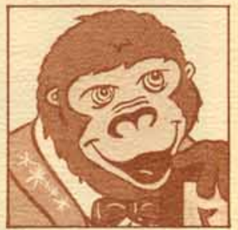
"THE KING KONG OF THE KEYBOARD"

Fats, lead vocalist and keyboard artist, has turned out to be the surprise star of The Rock-Afire Explosion but says it has been a long, hard road to his present success.