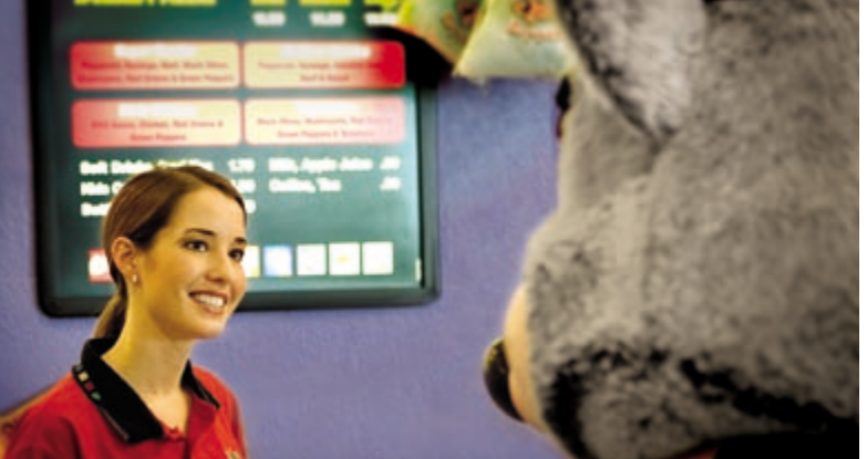
Listening to Parents