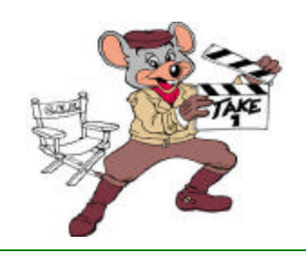
Very Important Stuff

*Please return all invalid shows back to the support center marked : ATTN: EN-TERTAINMENT DEPT AND YOUR STORE NUMBER.